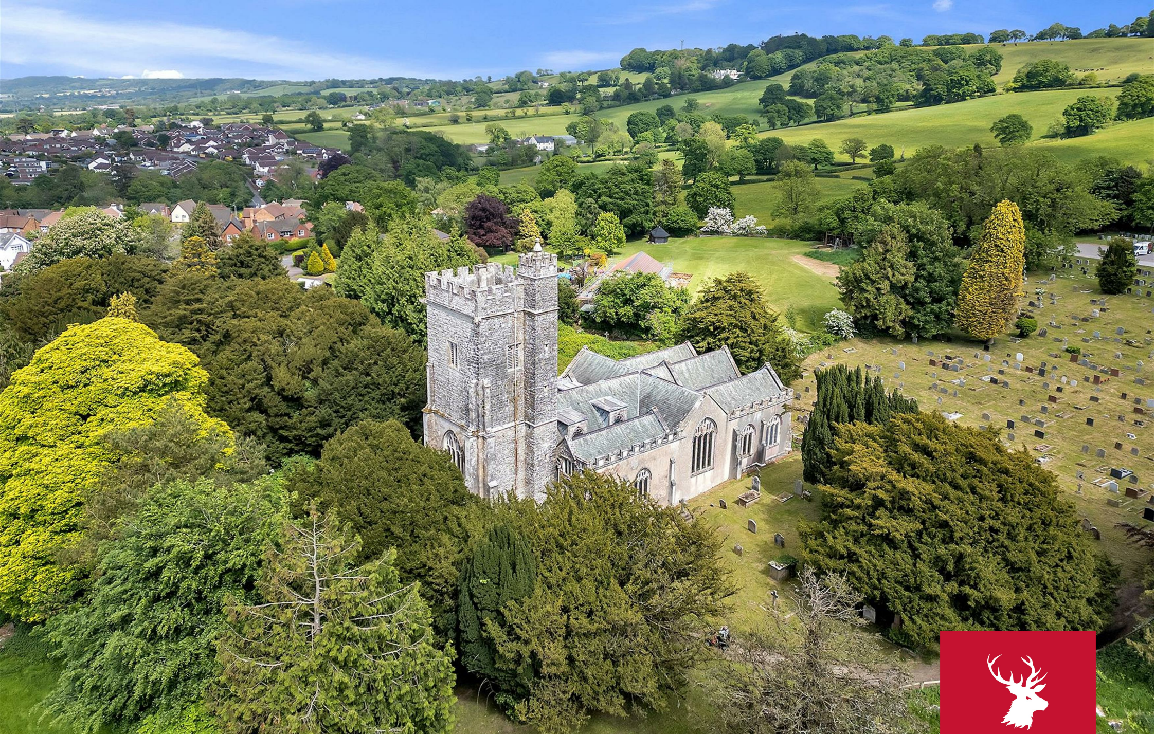
St Michael's Church